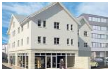
An artist's impression of how the shops and flats would look if plans by the Inverness Branch of the Royal British Legion get the go-ahead

It will include refurbishing the function room, lounge bar, toilets and main entrance.